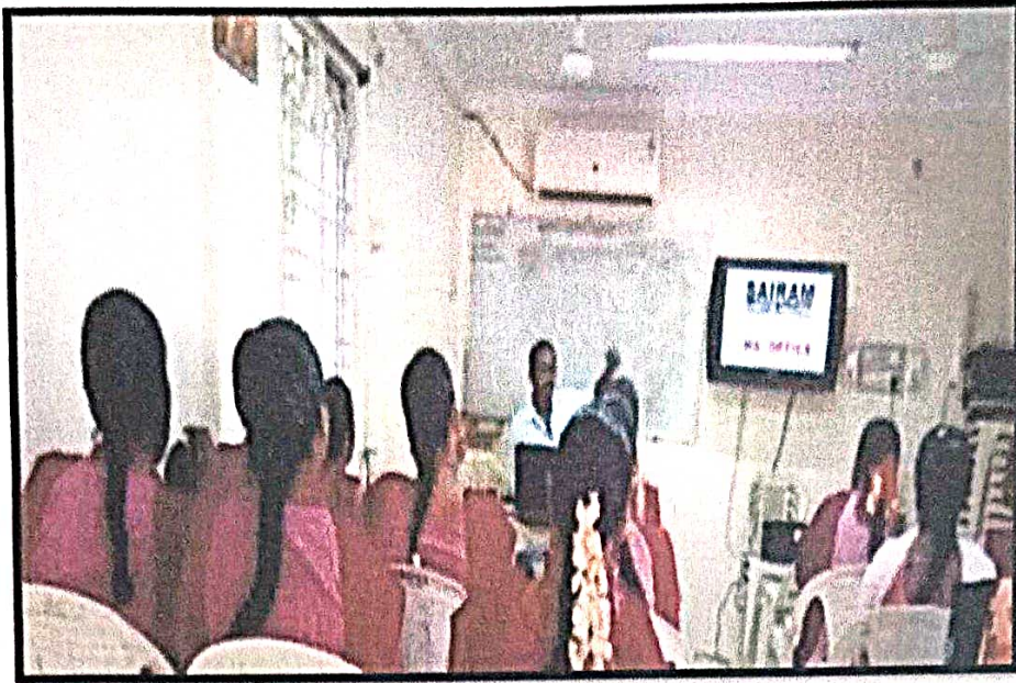
Training on M.S. Office for B.Com Students.